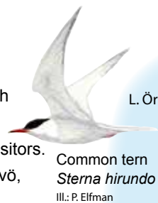
Common tern Sterna hirundo Ill.: P. Elfman

The archipelago also has a rich birdlife. Diving terns, elegant great crested grebes, and oystercatchers running around are a common sight. If you are lucky, you may spot an eagle soaring majestically in the sky. Look out for black woodpecker, wryneck and lesser spotted woodpecker in the pine forest.