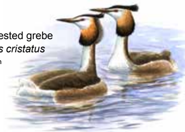
Great crested grebe Podiceps cristatus Ill.: P. Larsson