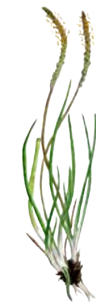
Sea plantain Plantago maritima Ill.: N. Forshed