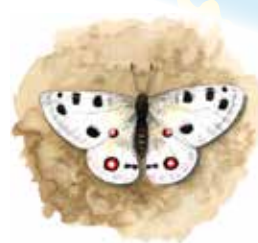
Apollo Parnassius apollo