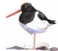
Oystercatcher Haematopus ostralegus Ill.: P. Larsson

1 Rågö village harbour. Unoccupied moorings can be used for short day visits. For overnight moorings, please use the guest harbour in Alviken.